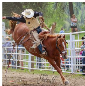
Shuswap Ec Dev Falkland rodeo colour